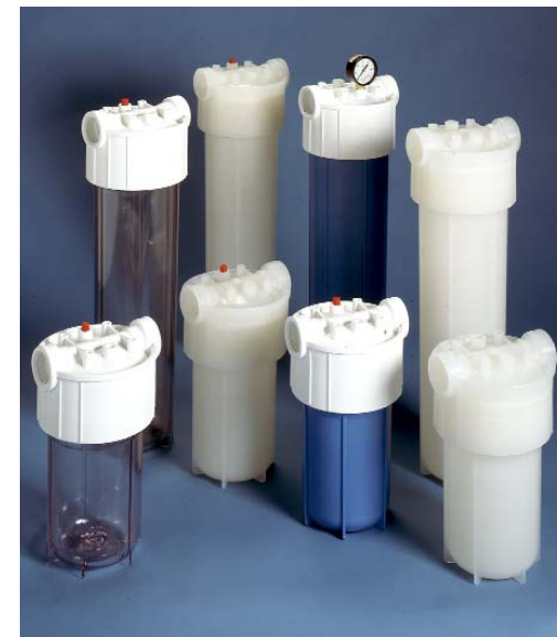
Giant Housings Request Bulletin GH-1