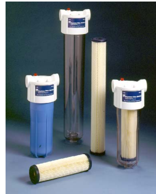
Sediment Filters Request Bulletin KF-2S