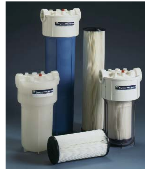
Giant Sediment Cartridges Request Bulletin GFK-2S