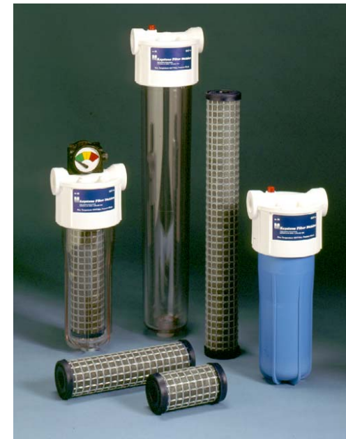
Taste and Odor Filters Request Bulletin KF-2TO